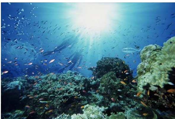
Great Barrier Reef, Qld

Instead of a day trip or cruise to the Great Barrier Reef , why not actually stay on it? Heron Island, a five-star resort with an eco-focus, is located right on the reef so you can wade out to swim amongst fish or baby turtles. Simpler cabin-style accommodation is available on Lady Elliot Island. Dive, snorkel, fish or learn about the reef from a marine biologist.