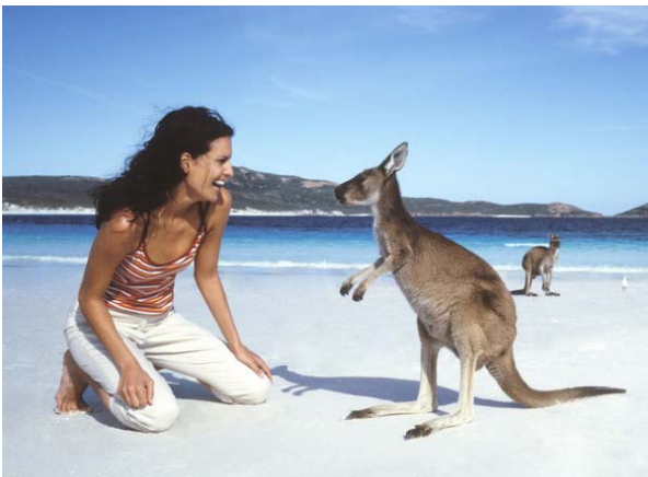
Kangaroos on the beach in Esperance, WA

Dodge the wildlife as you hike through bushland on Kangaroo Island . A third of the island is protected wilderness where you'll find sea lions basking on the beach, koalas napping in the gum trees and echidnas foraging among the leaf litter. Many native plants and animals which inhabit the island have been isolated making them clearly different from their relatives on the mainland.