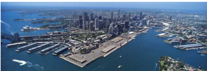
Barangaroo in East Darling Harbour

This is the first visit to Australia by Pope Benedict XVI and the first Papal visit to Australia for 13 years. Pope Benedict XVI will arrive by boat at Barangaroo in East Darling Harbour for his official welcome.