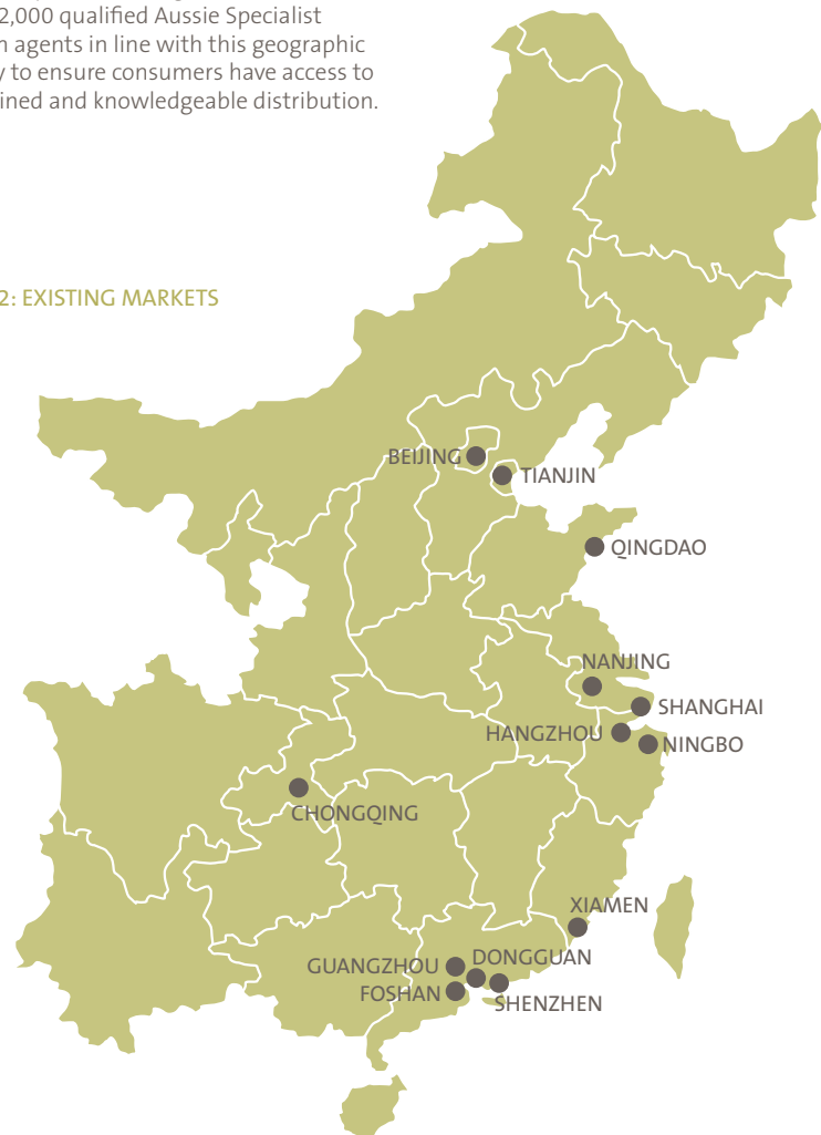
CHART 2: EXISTING MARKETS

Trade and distribution development will be the initial focus in new cities. Tourism Australia will build upon the strong distribution network of over 2,000 qualified Aussie Specialist Program agents in line with this geographic strategy to ensure consumers have access to well trained and knowledgeable distribution.