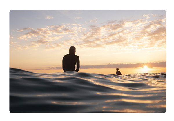
Latest National Visitor Survey (NVS) results

industry to provide much needed support for businesses doing it tough as a result of the pandemic. Register for the first of the live series here.