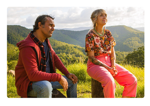
New ABC Docu-Series invites Aussies 'Back to Nature'