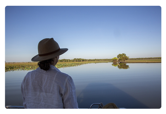
Mental health clinics in NSW and VIC

Tourism Research Australia has released its NVS results for May 2021. Positive results overall for the month of May 2021, with overnight trip expenditure exceeding 2019 levels by 9 per cent or an additional $540 million. The average spend per trip also increased to $778 up 25 per cent when compared to May 2019.