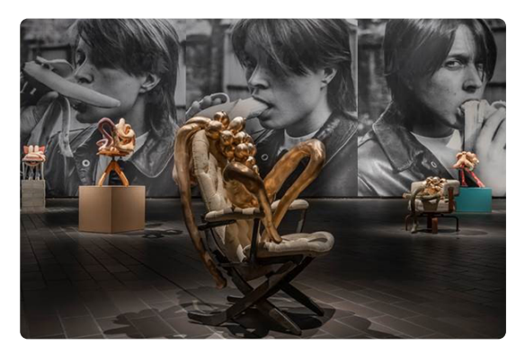
National Gallery of Australia launches Sarah Lucas exhibit